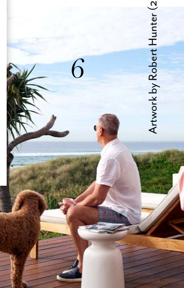
Artwork by Robert Hunter (2).

"My dream car is a 1955 Mercedes-Benz Gullwing coupé – silver with a red interior. It's the ultimate in design and detail."