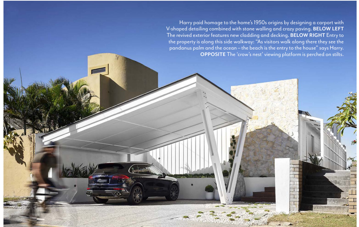
Harry paid homage to the home's 1950s origins by designing a carport with V-shaped detailing combined with stone walling and crazy paving. BELOW LEFT The revived exterior features new cladding and decking. BELOW RIGHT Entry to the property is along this side walkway: "As visitors walk along there they see the pandanus palm and the ocean - the beach is the entry to the house" says Harry. OPPOSITE The 'crow's nest' viewing platform is perched on stilts.