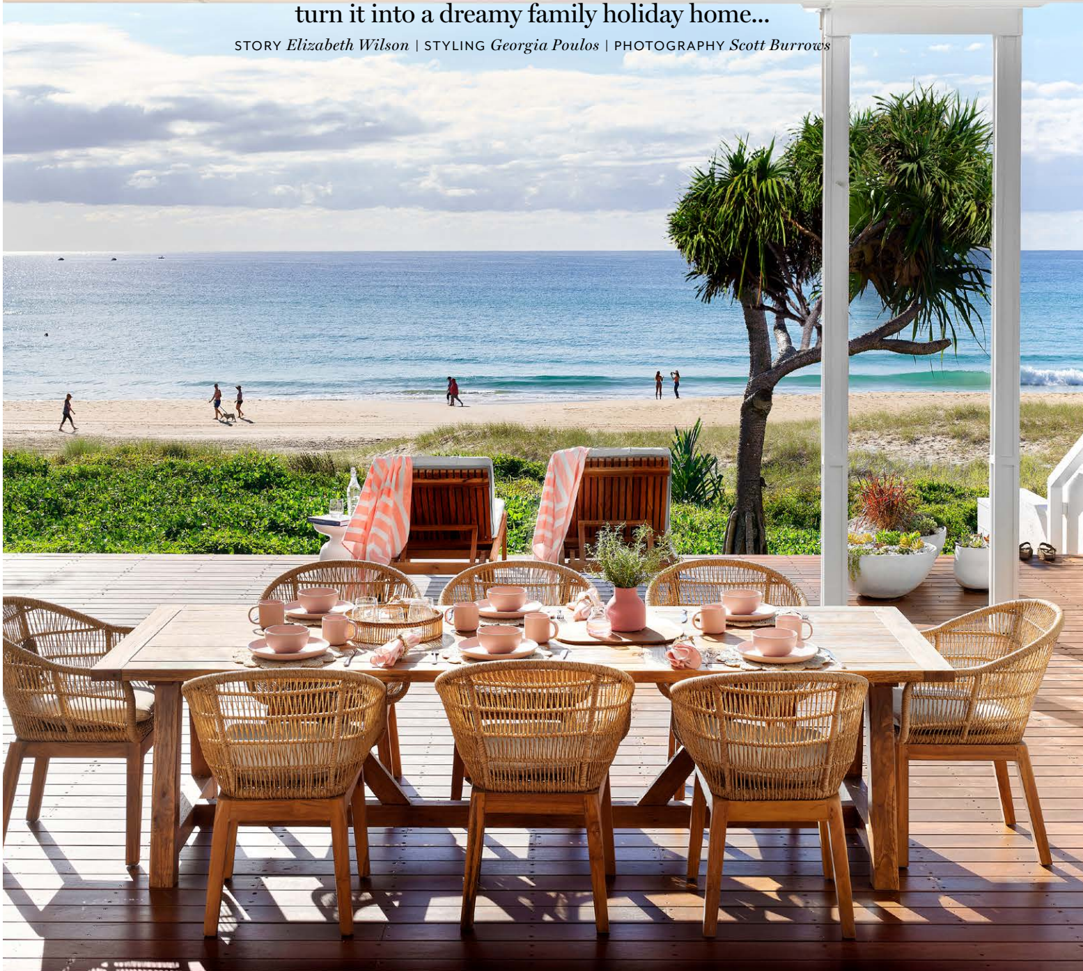
Breakfast on the deck is served with fresh sea air and the sound of waves lapping on the shore. The all-new decking is made from blackbutt. Aluminium louvres, Bradnam's Windows & Doors. Dining setting and deckchairs, The Bach Living. Pink tableware, Country Road.